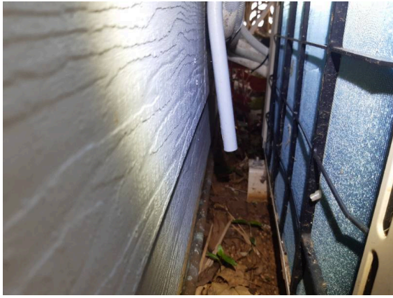
Example of air conditioner outlet pipe not attached to drain. Moisture may attract termites.