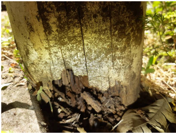
Example of decay in post at House. May attract termites.