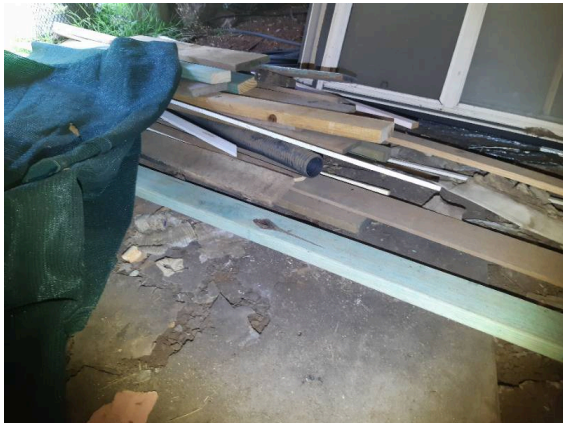
Example of timber on ground in subfloor. May attract termites.