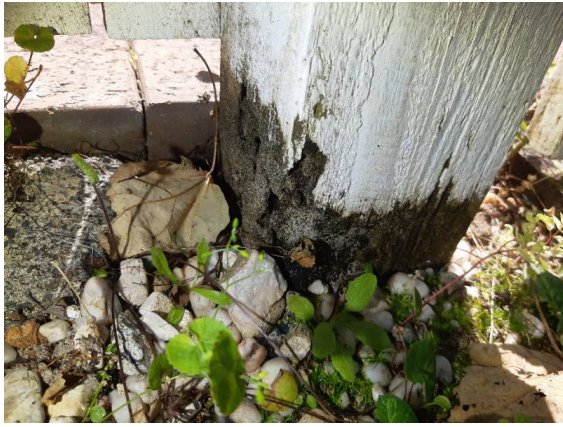
Example of decay in fence. May attract termites.