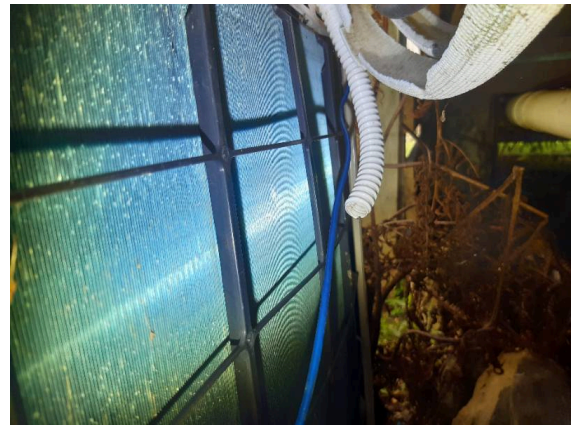
Example of air conditioner outlet pipe not attached to drain. Moisture may attract termites.