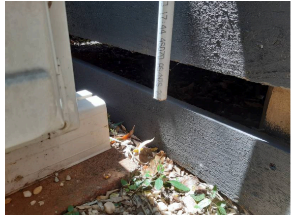
Example of air conditioner outlet pipe not attached to drain. Moisture may attract termites.