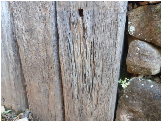
Example of termite damage in landscaping timber. Inactive at time of inspection.