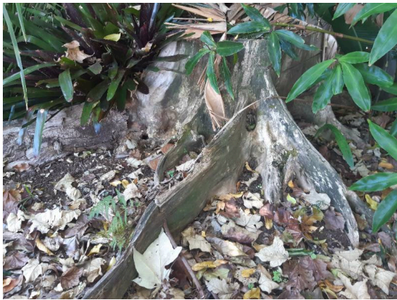
Example of decay in stump. May attract termites.