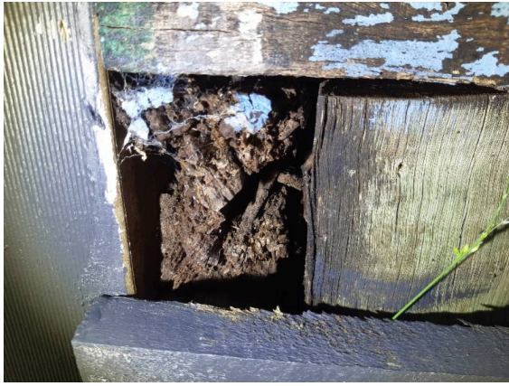
Example of decay in decking. May attract termites.