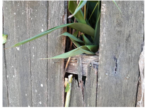
Example of decay in fence. May attract termites.