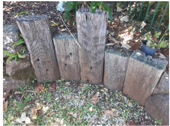
Example of landscaping timber on site. May attract termites.