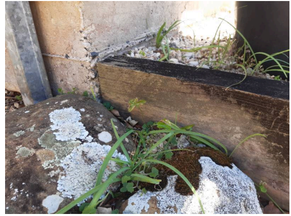
Example of landscaping timber near building. May attract termites.