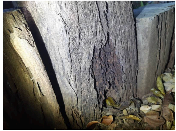
Example of termite damage in landscaping timber. Inactive at time of inspection.